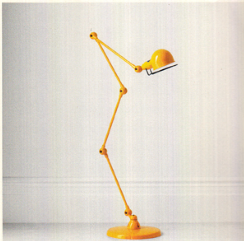
Signal Zigzag floor lamp by Jielde | A go-to piece for stylist Hilary Robertson (hilaryrobertson.com): "I love things that are functional but also sculptural. I've used this in a kid's room. It's also nice as a reading lamp in a bedroom. It's quirky—almost like having a pet in your house!" $595, shophorne.com.