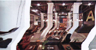
ACE HOTEL NYC ROMAN & WILLIAMS DESIGN THE ULTIMATE HIPSTER HANGOUT.