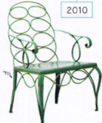
WHAT'S OLD IS NEW L.A.-BASED DOWNTOWN REINTERPRETS ELKINS'S ORIGINAL FOR OUTDOOR LIVING.