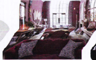
CROSBY STREET HOTEL A LITTLE LESS INDUSTRIAL; A LOT MORE COLORFUL. INTERIOR DESIGN BY KIT KEMP.