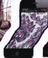
FORTUNY APP NEW TECHNOLOGIES MEET OLD-WORLD LUXURIES.