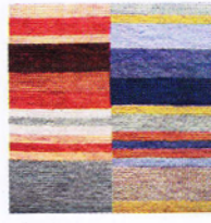
HOOKED RUGS COTTAGE CRAFT WITH A MODERN SPIN. RED SPRUCE COLLECTION FOR ODEGARD.