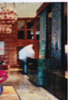
VICEROYS MIAMI INTERIOR DESIGN BY KELLY WEARSTLER.