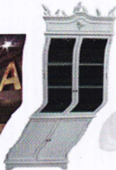
CURIOSITY CABINETS LIGHTER AND LESS MACABRE. SIMONE FROM OLY STUDIO.