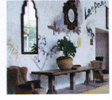
THE MELROSE PROJECT TOMMY AND KATHLEEN CLEMENTS BRING VERVOORDT'S SPIRIT TO WEST HOLLYWOOD.