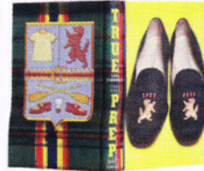
TRUE PREP AN UPDATE OF THE ORIGINAL PREPPY HANDBOOK — MORE OF WHAT YOU LOVED.