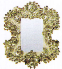
ROCOCO REDUX NEUTRAL NATURALS. STELLA MIRROR FROM MADE GOODS.