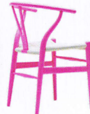
WISHBONE CHAIR HANS WEGNER'S MIDCENTURY CLASSIC, NOW IN PINK. FROM SUITE NEW YORK.