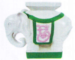
LILLY PULITZER THE 1960S LEGEND INSPIRES NEW HOME COLLECTIONS. THE HEIRSS STOOL FROM LILLY PULITZER