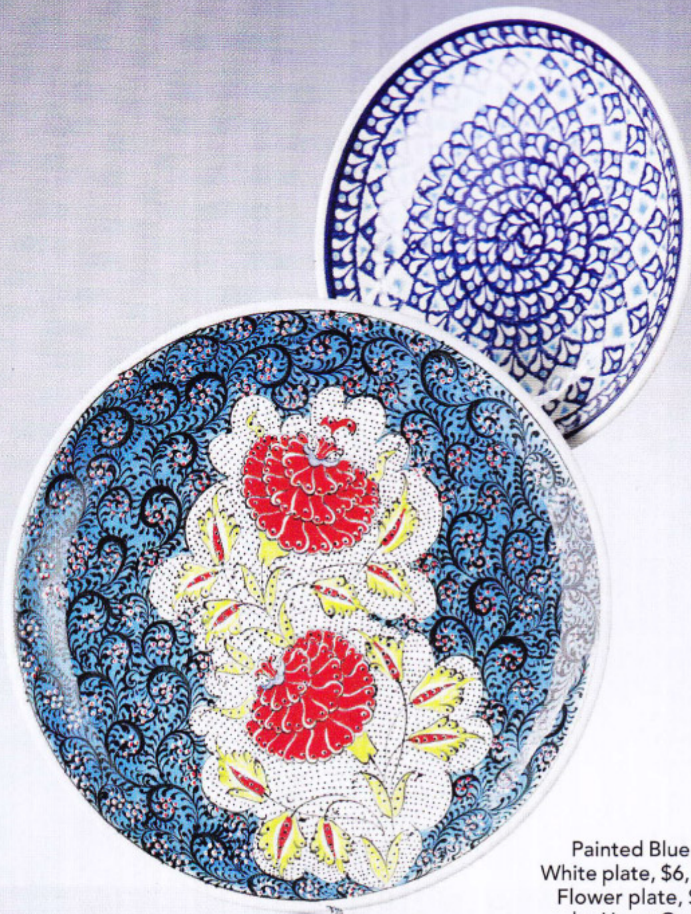
Painted Blue and White plate, $6, and Flower plate, $10, by HomeGoods; homegoods.com.

Leo bookends $240 for a pair, by Made Goods mecoxgardens.com