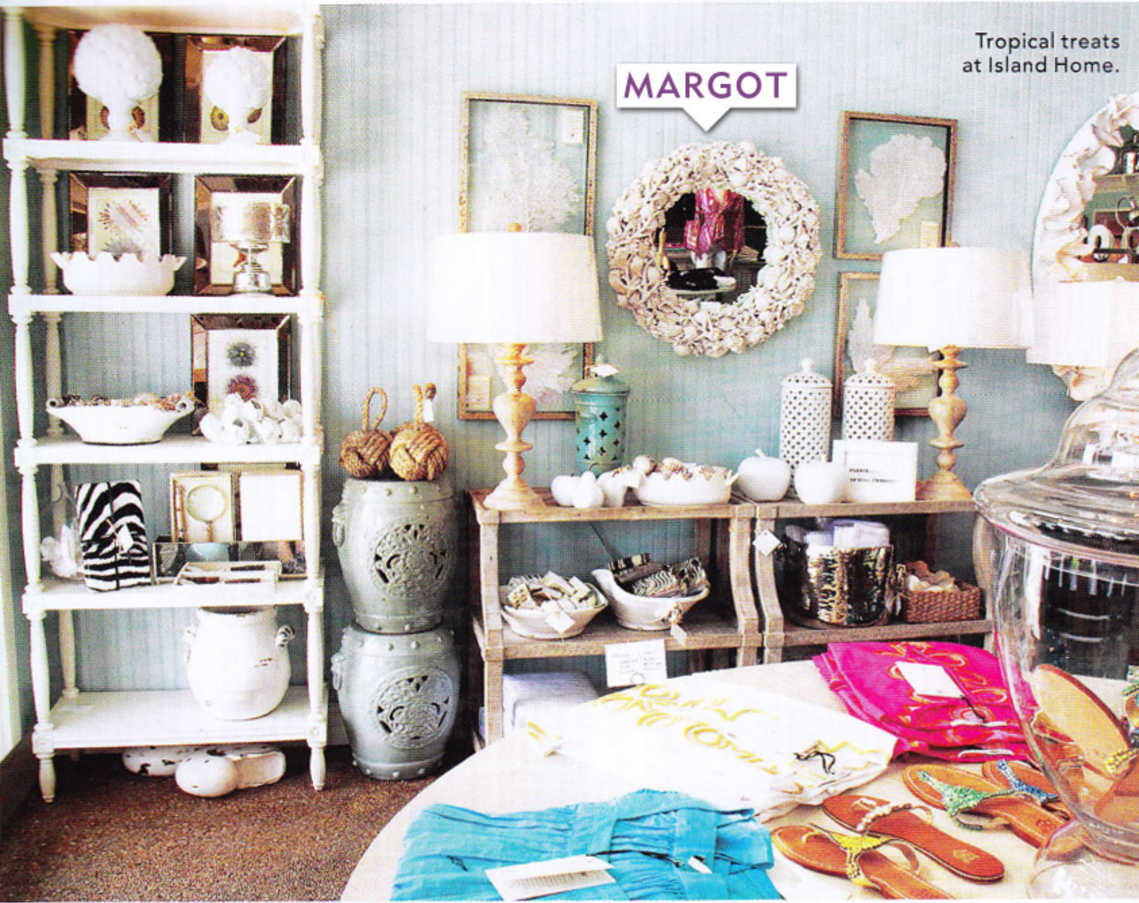
Tropical treats at Island Home.