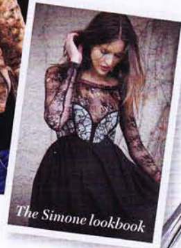
The Simone lookbook