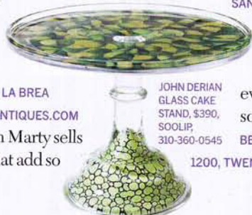
JOHN DERIAN GLASS CAKE STAND, $390, SOOLIP, 310-360-0545