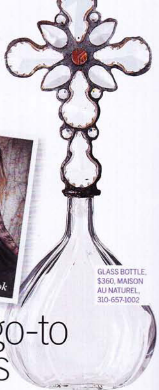
GLASS BOTTLE, $360, MAISON AU NATUREL, 310-657-1002