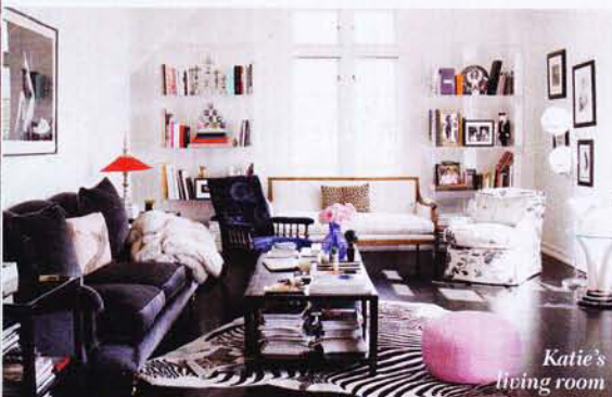
Katie's living room