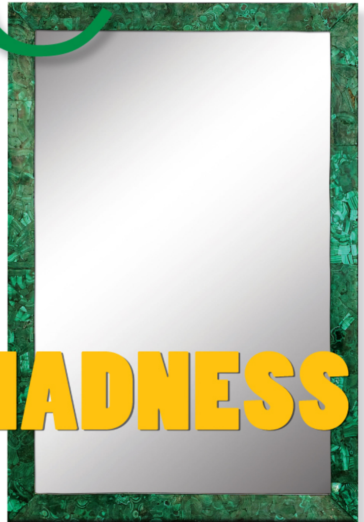
Framed entirely in malachite, the Vivian mirror from Made Goods opts for ornamental with stunning semiprecious stones ($4,400).