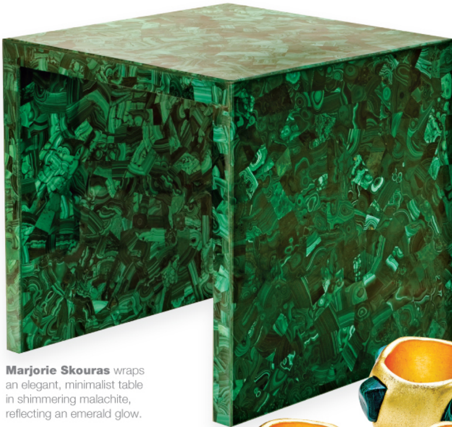
Marjorie Skouras wraps an elegant, minimalist table in shimmering malachite, reflecting an emerald glow.