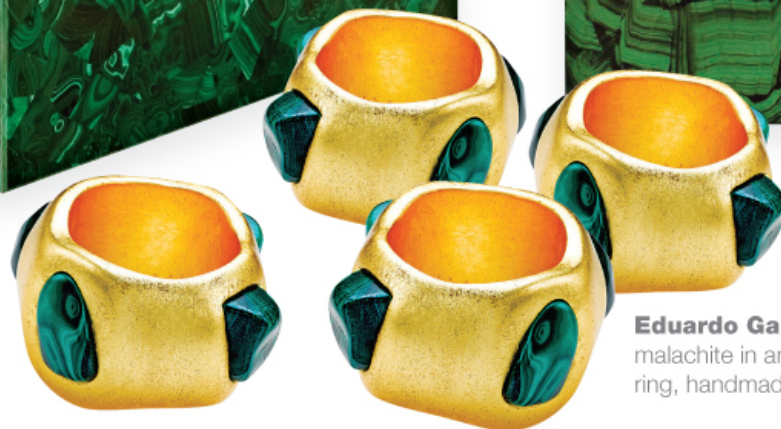
Eduardo Garza crafts gold leaf and malachite in an organically rendered napkin ring, handmade to order ($225 each).