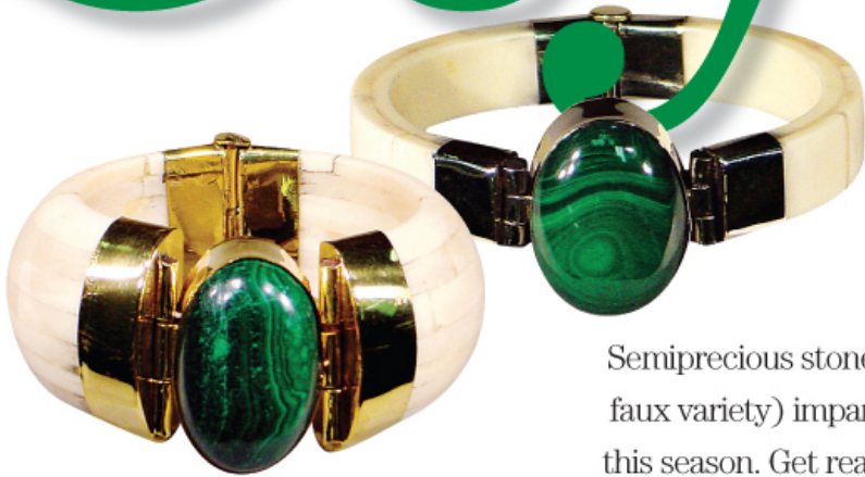
Water buffalo bone meets malachite cabochons in Bougainvillea's dramatic pin closure bracelets ($43 to $47).

Semiprecious stones (of the real or faux variety) impart stunning style this season. Get ready to be dazzled by this swirling banded gem with an unexpected cache of luminous jewels for the home. — Tracy Bulla