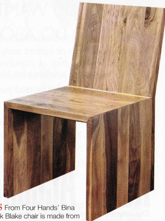
FOUR HANDS From Four Hands' Bina Collection, the sleek Blake chair is made from exotic hardwoods gathered from demolished South American buildings ($463).