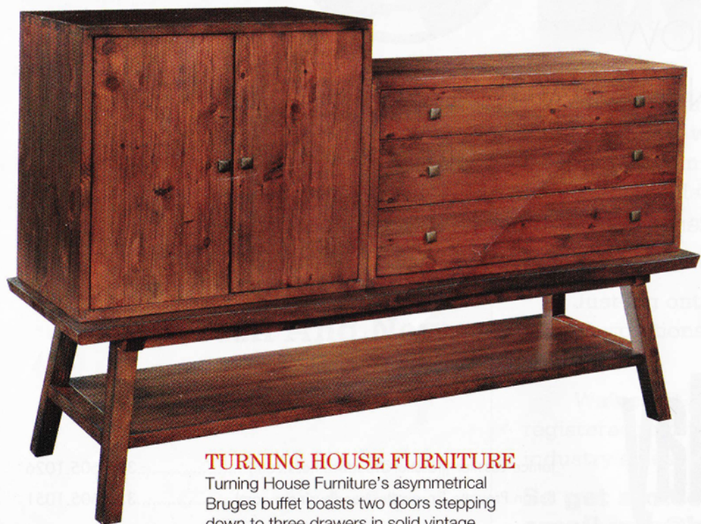
TURNING HOUSE FURNITURE Turning House Furniture's asymmetrical Bruges buffet boasts two doors stepping down to three drawers in solid vintage pine reclaimed from derelict mills, distilleries and tobacco warehouses ($1,999).

The en-vogue way to source wood right now is from anywhere other than a living tree, and more adherents than ever before are getting on board the reclaimed bandwagon. Retrieved from old buildings, forest floors and piles of scrap, most of this timber was destined to burn or rot. But the trend is not merely about saving trees or using up waste. Found wood often hails from rare wood species, exhibits unique characteristics or easily lends itself to handcrafted one-of-a-kind pieces. Fresh timber cannot mimic the aura of age and history which gives such warmth to even the most modern of these designs. — Angela Heck