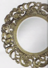
Waves crest around Stein World's wall mirror with its round beveled glass and dark finish ($340). IFC W447-H