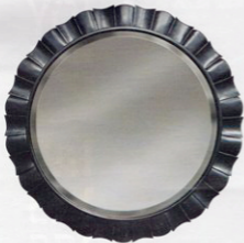
The hand-carved wood Round Petal mirror by Trade Winds Furniture alternates concave and convex scallop shapes to create a unique ripple effect ($250). IFC I1110

These mirrors are this season's answer to the fairytale question. Round and square frames steal the show while black or black finishes make a trendy statement. Mirrors deserve their rising popularity with their near-magical ability to enlarge spaces and create alluring ambience. —Angela Heck