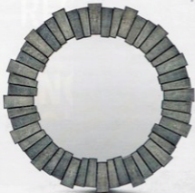
Faux shagreen leather, mimicking the color and patterns of stingray skin, radiates out from a circular mirror in artfully staggered rays in the Claude mirror from Made Goods ($1,200). IFC I1403