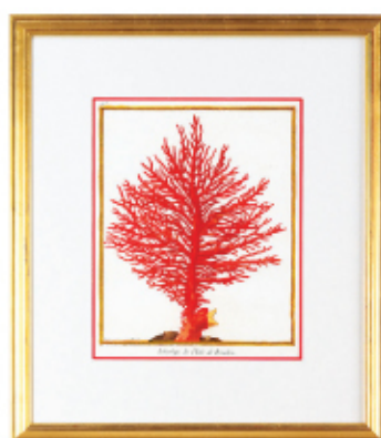
W.King Ambler, $300