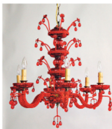
Canopy Designs, $1,855