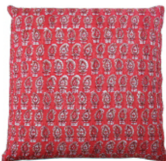
Dransfield & Ross, $220 to $300