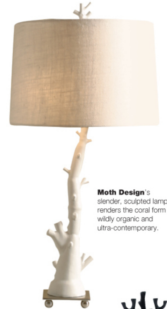
Moth Design's slender, sculpted lamp renders the coral form wildly organic and ultra-contemporary.