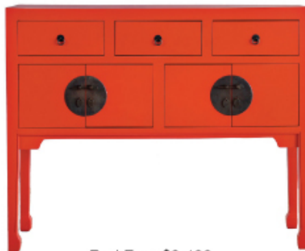
Red Egg, $2,400