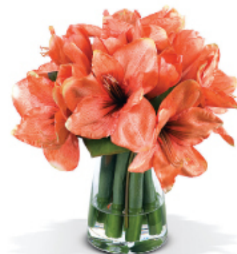
New Growth Designs, $260