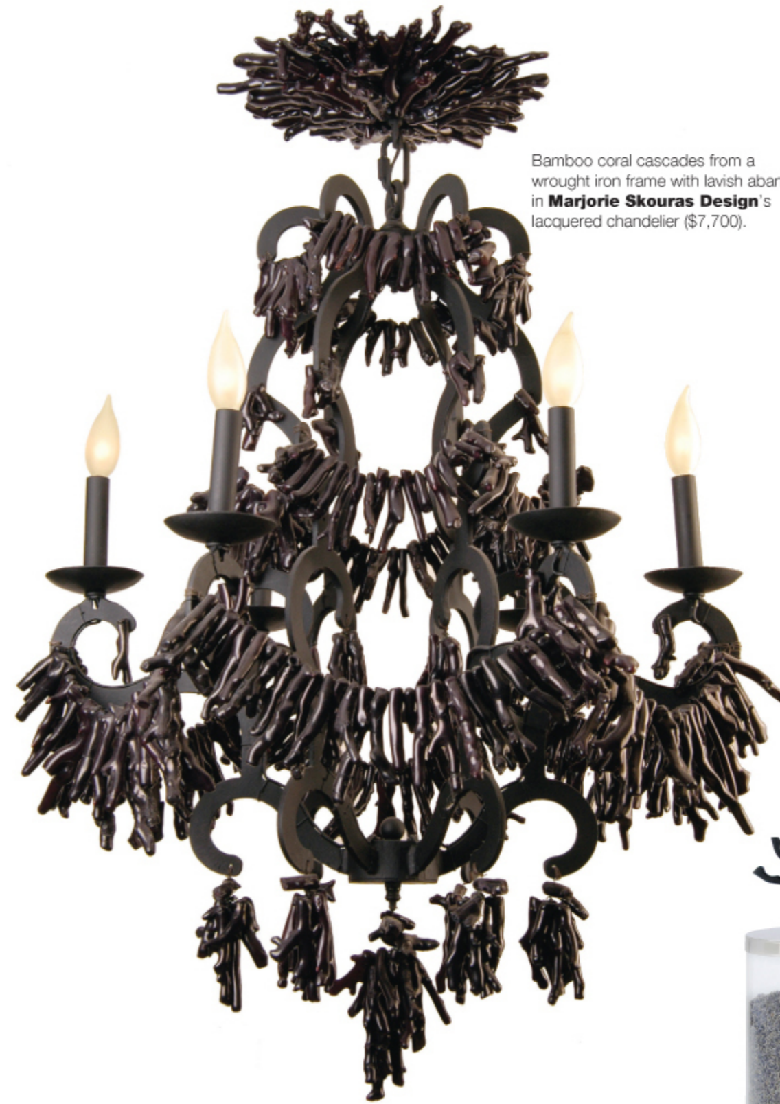
Bamboo coral cascades from a wrought iron frame with lavish abandon in Marjorie Skouras Design's lacquered chandelier ($7,700).