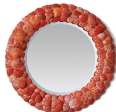
Made Goods, $1,000