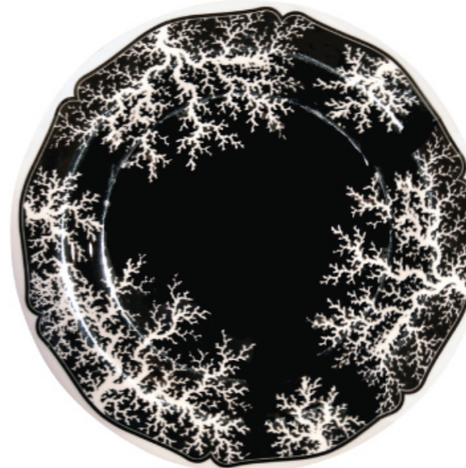
Lacy sprigs of coral load up Bongrenre's melamine plate with an extra helping of style ($12 to $15).