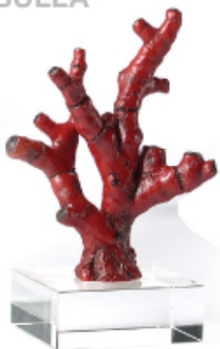
Tozai Home, $90