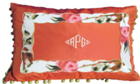
Ann Gish, $160