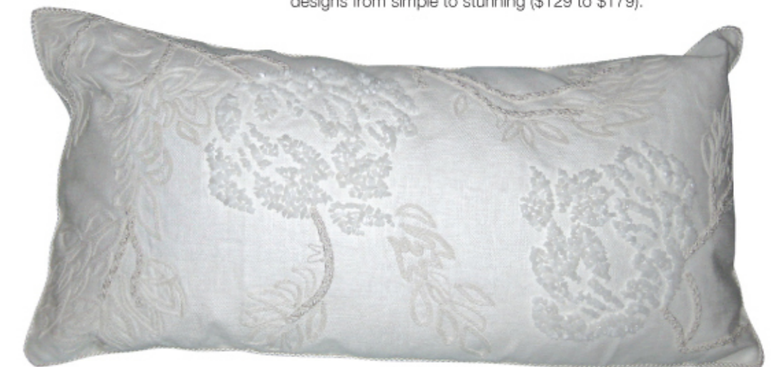
Coral gemstones branch across Ankasa's purist pillow with a gossamer-spun hand.