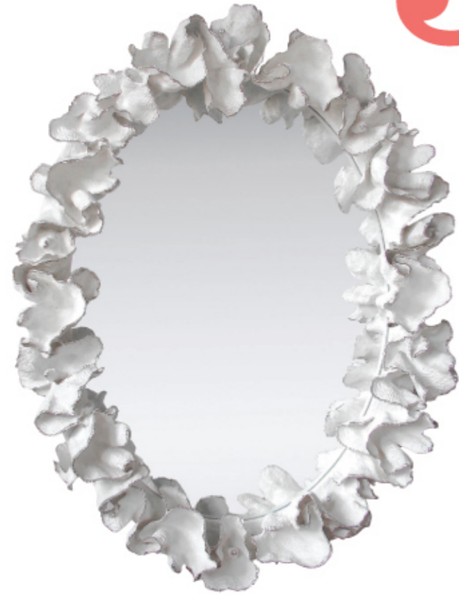
Surrounded by shimmering silver, artfully reproduced coral almost appears to sway underwater in Made Goods' hand-painted mirror ($2,800).

Float away on a stylized reef chock full of organic chic. Whether free-flowing and ethereal or boldly modern, it's all the more stunning in graphic black and white. — Tracy Bulla