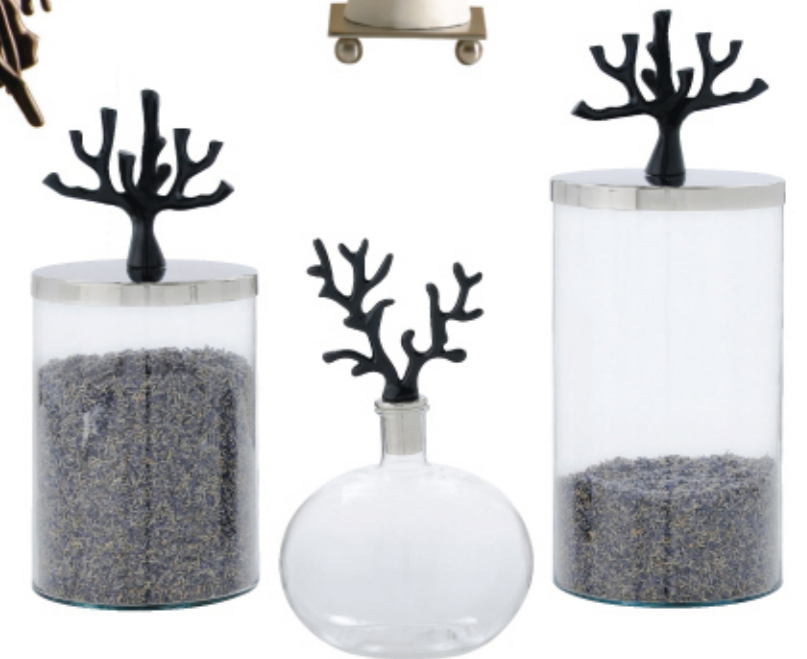
Sculptural toppers transform Arteriors Home's glass designs from simple to stunning ($129 to $179).