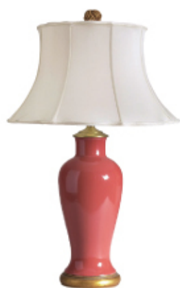
Chelsea House, $665