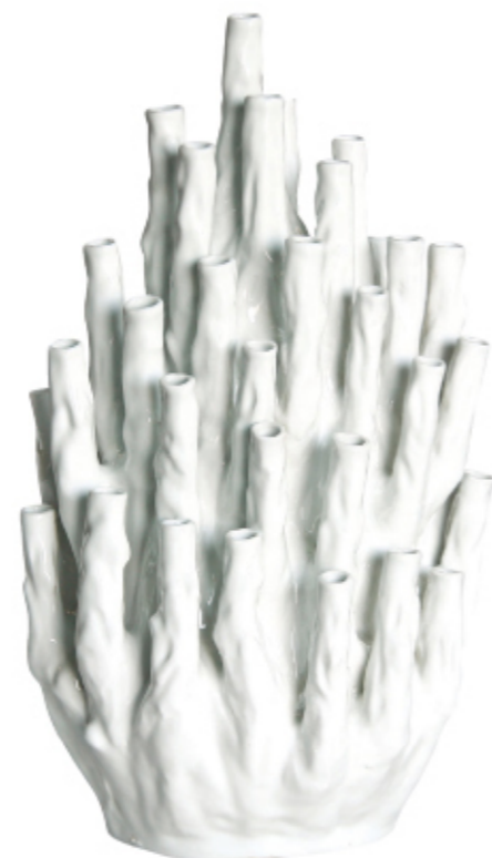
Free-form coral motifs create an exquisitely detailed porcelain tulipiere from Legend of Asia ($300 to $450).