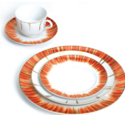
Porcel, $30 to $60