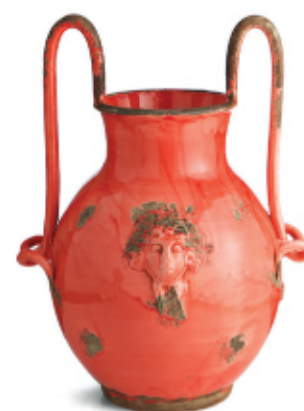
Arte Italica, $373