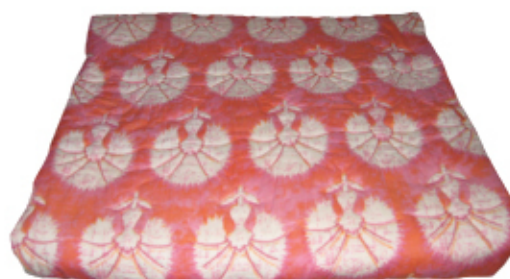
Shades of India