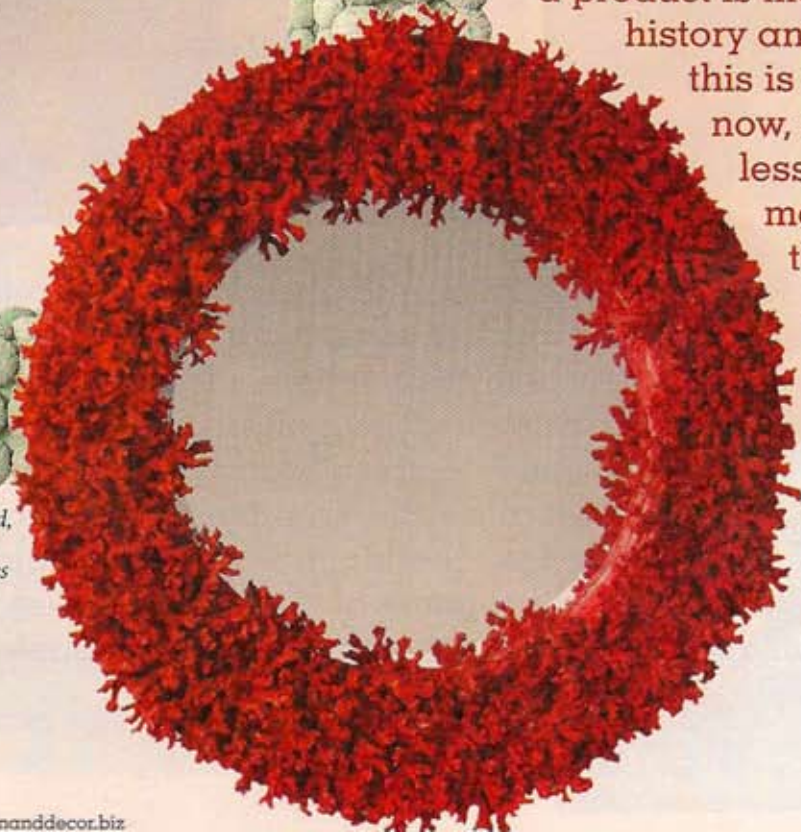
◀ Giselle offers the look of natural coral, without the harvesting of the earth's natural coral reefs. It measures 24 inches round. Choose the Coral Red or Coral White finish. www.madegoods.com